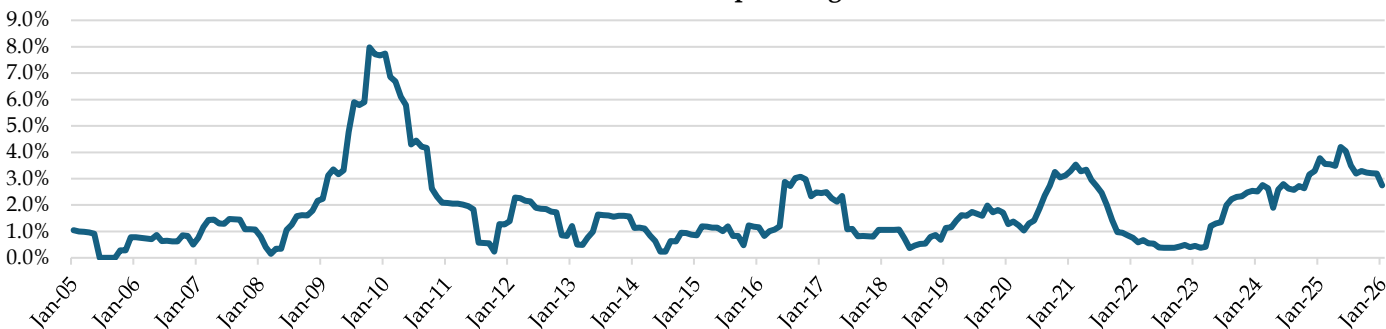
Default Rates - European High Yield

Source: JPMorgan Research, as of January 31, 2026. Trailing 12-month basis, dollar-weighted. Excludes Banks/Insurers.